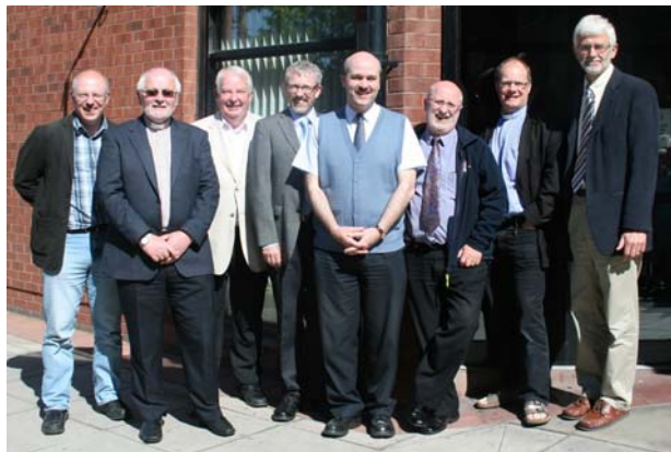
Members of UKBHC and representatives of NIHCA in the Belfast sunshine

The Board held its June meeting in Belfast, and had constructive discussions with representatives of the NI Healthcare Chaplains' Association (NIHCA). This continues the Board's commitment to working with and learning from chaplaincy organisations and individuals in all parts of the UK.