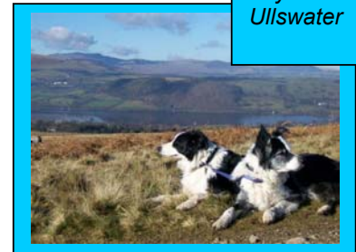
Mollie & Skye at Ullswater